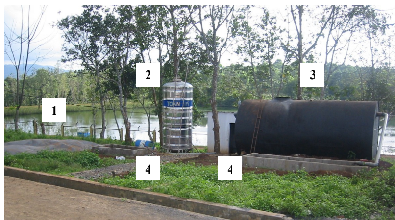
Biogas installations with gas bag (1), digester (2), neutralisation (3) and settlement tanks (4)

Presently, a pilot biogas plant is in place which will reduce up to 90% of BOD content and deliver up to 1 litre methane per litre neutralised waste water. However, to make good biogas at a low pH of 6.1 of waste water, a special strain of methanogenic bacteria, developed especially for the Khe Sanh project, to metabolise calcium acetate, is needed. The methane